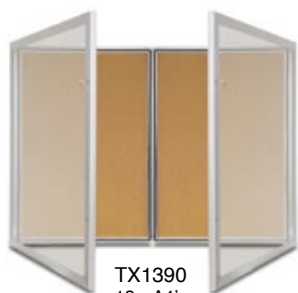
TX1390 12 x A4's