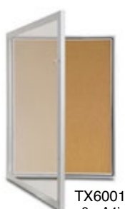
TX6001 9 x A4's