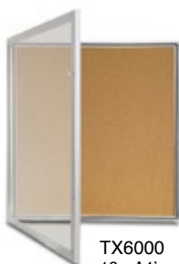
TX6000 12 x A4's