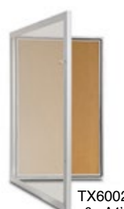
TX6002 6 x A4's